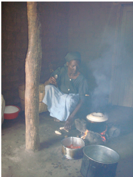
Figure 1 Woman cooking indoors in rural Chikwawa. In the dry season it is more common to cook outdoors or on the veranda (khondi). However, in the wet season or the evenings cooking is often conducted indoors. The situation in the urban environment is similar although indoor cooking (and heating) is more frequent because of cooler average temperatures.

from and 1200 m lower altitude than urban Blantyre. The urban homes were randomly selected from 360 Blantyre residents who had previously volunteered for studies at the Malawi-Liverpool-Wellcome Trust Clinical Research Programme (MLW). Selected homes were then visited by a fieldworker, and the residents invited to participate. Rural entomology studies based in Chikwawa had established contacts with the local health surveillance officers in the area. Contact was made with village elders through health surveillance officers and the project was explained to the community. Village homes are similar in design and construction; the first home was chosen as closest in a random direction from the village elder's house and a snowball sampling strategy was then used to select the other homes. The study was carried out during April 2008 (dry season).