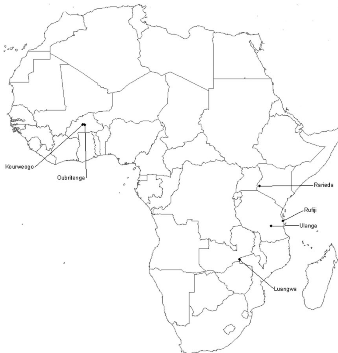
Figure 1 Map of Africa showing locations of study sites

observations were recorded by a field worker who sat in a randomly selected compound and recorded the number of people who were awake at hourly intervals from 6.00 pm until all of them retired indoors. A similar procedure was used in the same compound from 4.00 am to 6.00 am on the following morning. In the MTC study, four questions were incorporated into standard cross-sectional malaria indicator survey questionnaires asking when, to the nearest hour, the respondent went indoors for the night, went to bed to sleep, awoke in the morning, and left the house in the morning.