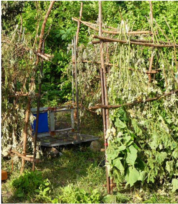
Figure 2. A small target closely surrounded by 15 cm hedges to investigate the effect of thick grass regrowth. doi:10.1371/journal.pntd.0001336.g002

(9.9 flies/day, s.e.d. = 0.08) caught 80% ( P < 0.001 ) more females than the target with one drum in front (Treatment A, 2.0 flies/day) and 98% more females than with a drum on each side (Treatment B, 0.03 flies/day). Catches of male G. f. fuscipes showed no significant difference ( P = 0.2 ) between the target in the open and either of the treatments, although 20% less flies were caught with one drum in front of the target (Treatment A, 3.2 flies/day) and 80% less with a drum on each side of the target (Treatment B, 0.2 flies/day), completely obscuring the frontal views. When placing a target next a real tree trunk (Table 1, exp. 9) there was a doubling in female catches with both the blue cloth closest to