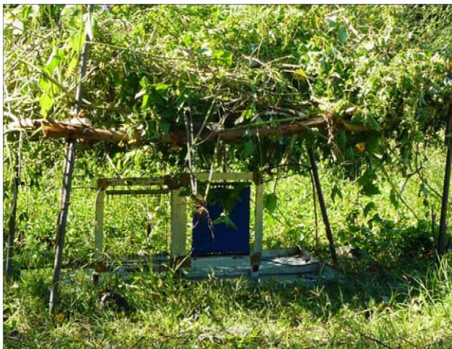
Figure 3. A small target underneath a 0.5 m high leafy canopy to investigate the effect of overhanging vegetation. doi:10.1371/journal.pntd.0001336.g003

Vegetation encroachment around a small target, from the sides and above, does not significantly affect its killing efficiency for G. f. fuscipes as long as there are some openings between adjacent bushes, wider than 30 cm. These results are intriguing because the rapid re-growth potential of the tropical vegetation in the habitat of G. f. fuscipes and other Palpalis group tsetse, combined with the small size of the targets, could make it seem improbable that these targets will remain effective. Indeed, our results show that only one such scenario, grass regrowth very close to the target, poses a serious threat to their performance. Our simulation of grass height corresponds roughly to between c. 15 (15 cm high) and 60 days (60 cm high) as observed in the rainy season in the field. As expected, the small diameter clearings (0.75 m) created by the