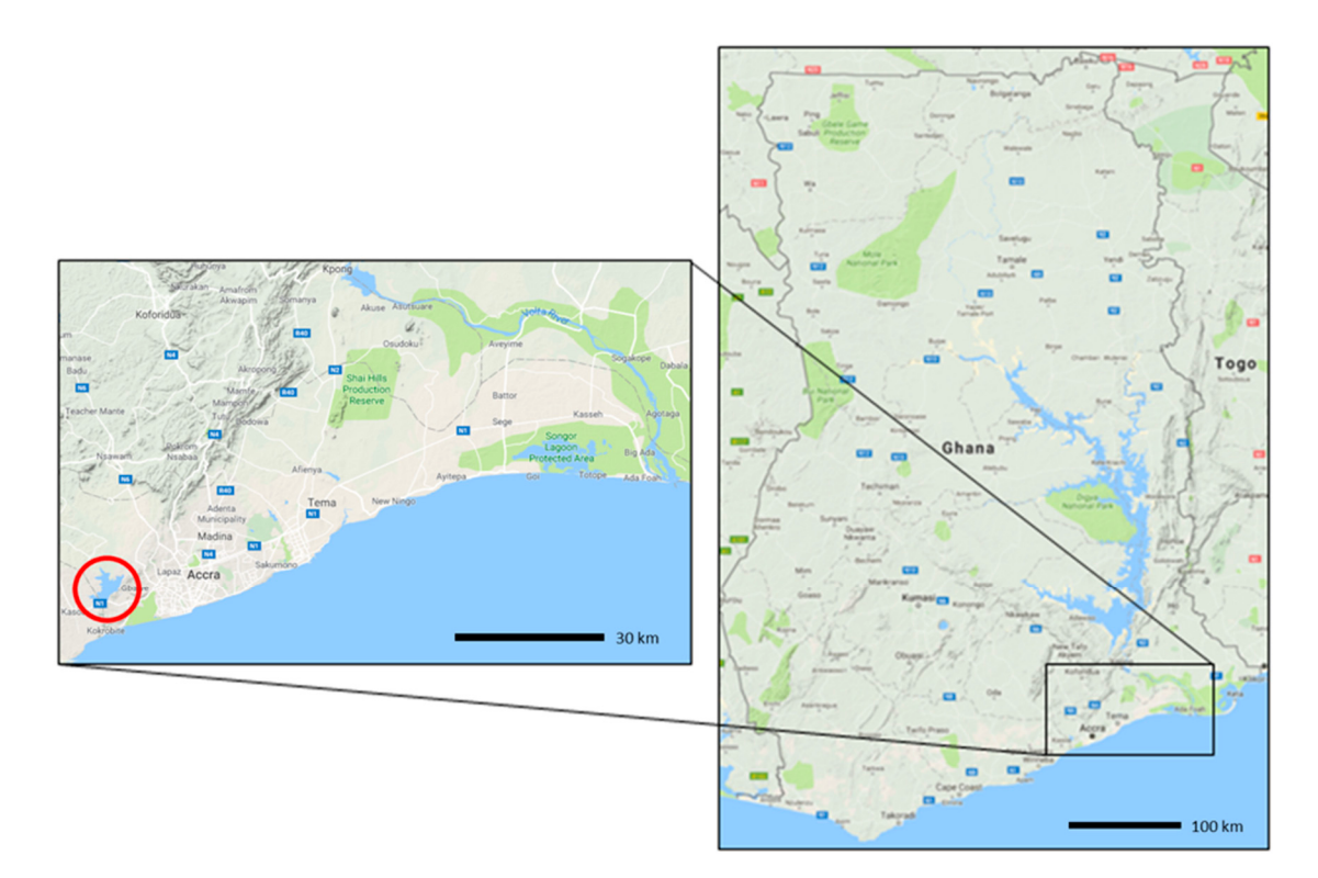
Figure 1. Map of Ghana showing location of study regions; images adapted from Google maps.

Due to the highly spatially focal nature of schistosomiasis, regions have been purposively selected according to known endemicity (based on National NTD Control Programme data). Communities within these regions have been selected based on prevalence of at least 10% of schistosomiasis infection (being S. mansoni or S. haematobium , or both), and proximity to water bodies containing intermediate snail hosts that has previously been ascertained (JRS unpublished). Typically, STH are co-endemic with schistosomiasis in these regions, but are not the basis for site selection, which is the focused on a peri-urban setting surrounding a manmade reservoir. In Ghana, most health care is provided by the government and is largely administered by the Ministry of Health and Ghana Health Service (GHS). There are five levels of health care provision: health posts, health centres and clinics, district hospitals, regional hospitals, and tertiary hospitals. Administratively, GHS is organized at national, regional, and district levels [33]. There are 110 health districts. For Ghana, three communities were selected in Ga South District (Greater Accra Region) (Figure 1). Due to the highly focal nature of disease, we will use routine data collected by GHS and CSIR to serve as controls.