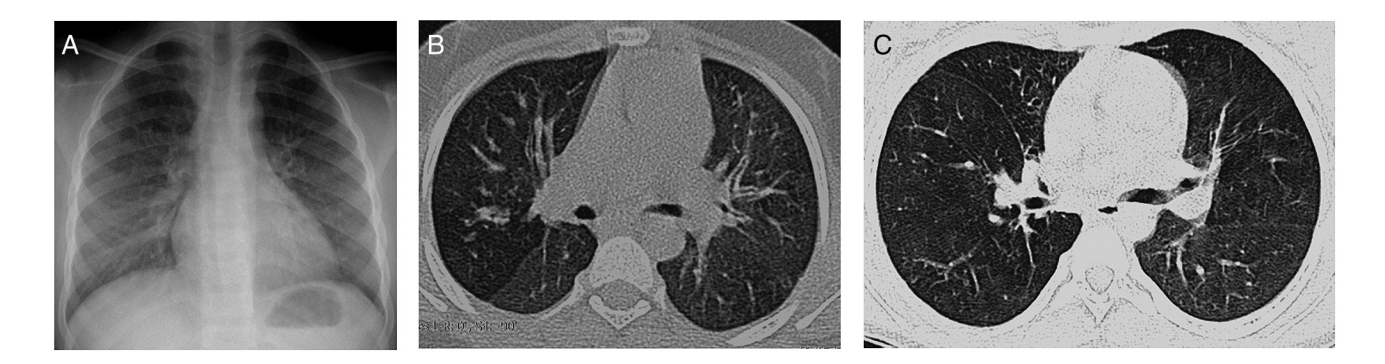
Figure 2. A, Chest radiograph of a participant scored as normal independently by both radiologists. B, High-resolution computed tomographic (HRCT) scan of the same patient, through the midzone demonstrating a striking mosaic pattern with areas of decreased attenuation adjacent to regions of normal lung density. C, HRCT scan of another patient, again showing regions of decreased attenuation as part of the mosaic pattern with cylindrical bronchiectasis in the middle lobe.

OB as the likely cause of chronic lung disease in HIV-infected children. Importantly, there was a strong correlation between the extent of decreased attenuation and the extent of bronchiectasis, again strongly supporting airway-based pathology.