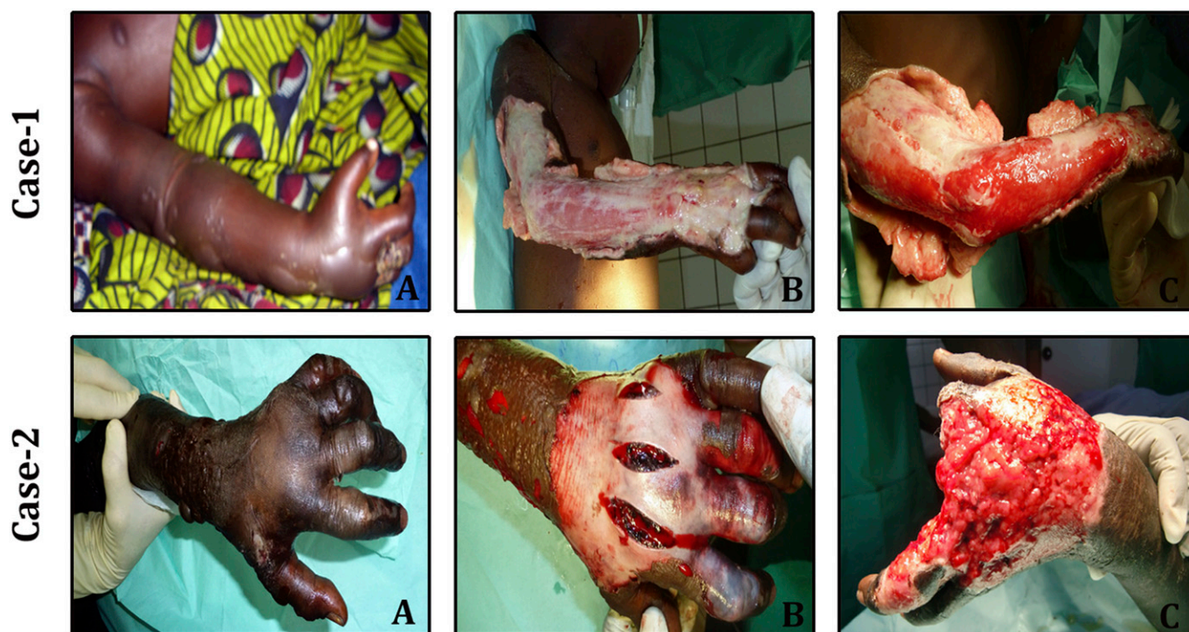
FIGURE 1. The pictures represent the gravity of snakebite-induced sustained tissue decay at the bite site. Case 1: (A) initial examination showed that the right hand and forearm were swollen, (B) initial perioperative observations, and (C) after wound cleaning. Case 2: (A) initial aspect of the left hand, (B) fasciotomy, and (C) clean aspect of the hand, after eight surgeries. Figures reprinted from Ref. 21. Copyright by CEVAP/UNESP. Reprinted with permission. This figure appears in color at www.ajtmh.org .

We have reported 29 that E. carinatus venom induces a strong inflammatory response at the injection site starting with an influx of neutrophils (polymorphonuclear leukocytes). They are the first line of defense cells and major phagocytes of innate immunity. As an ultimate defense, neutrophils commit suicide, resulting in the release of their de-condensed DNA fibers/chromatin, which form structures called neutrophil extracellular traps (NETs) by a process called NETosis. 30–34 We showed that E. carinatus venom readily elicits intense and stable NETs at the injection site through a mechanism dependent on reactive oxygen species (ROS). The extruded DNA fibers/chromatin (NETs) from hundreds and thousands of neutrophils form a physical plug in the blood vessels that 1) prevents blood flow to tail tissue distal from the venom injection site, 2) sequesters venom toxins in that site through ionic interactions, and 3) causes accumulation of toxic metabolites, and hypoxia. Furthermore, sequestration of venom toxins, such as the extracellular matrix (ECM)-degrading hemorrhagic snake venom metalloproteases (SVMs), resulting in the degradation of