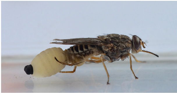
Figure 2. A female tsetse fly ( Glossina morsitans morsitans ) is giving birth to a third instar larva. The larva often weighs more than the female fly.

gland. [24] All three in utero larval instar stages are completed in \approx 9 days (reviewed by Benoit et al. [25] ). Shortly after birth, the larva quickly burrows into the soil, where it is relatively well protected from most predators and parasites during pupation. [26] The larva has all the energy and raw material reserves needed to develop into an adult and to survive the search for its first bloodmeal. In contrast to tsetse flies, keds, and bat flies, other blood-sucking female flies produce batches of many eggs. These eggs are then abandoned to an uncertain fate, leaving the small, newly hatched larvae to find their own food in water bodies or damp habitats that are essential for completing development. [27]