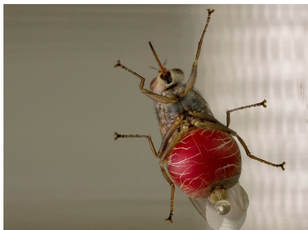
Figure 1. A recent blood-fed tsetse fly ( Glossina morsitans morsitans ) seen through the plexiglass sheet on which it is resting. Within a few minutes, the fly must rapidly excrete 80% of the water and salts from the blood-meal using a process called diuresis. A drop of excreted fluid has already fallen onto the plexiglass cage wall and is acting as a magnifying glass to accentuate the next droplet forming.

It is intriguing, therefore, that a reviewer who rejected Ellstrand's first submission of his JSS essay to another journal wrote "... it is difficult to see how any organism with a nutritionally dependent juvenile could produce a juvenile of larger mass, unless the adult acts like a nutrient pump over a long period of time, slowly inflating the ballooning infant". How ironic that this sentence, written in deep scepticism, describes the very process of prenatal juvenile development in tsetse flies, keds, and bat flies. In this essay, we focus on the causes and consequences of producing relatively large offspring in tsetse flies, as there are extensive data on their ecology and life history and because of their capacity to transmit the fatal diseases known as the African trypanosomiasis.