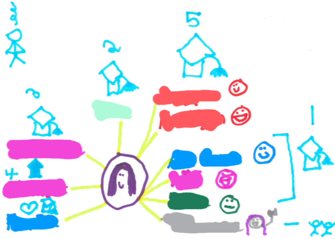
Figure 1: Example of a friendship map