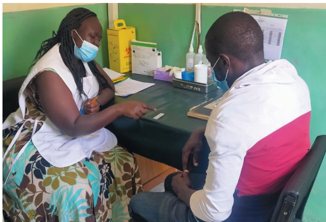
Photo: Kisumu community counsellor discussing COVID RDT result with client (from Emmanuel Milimo's own collection, used with permission).