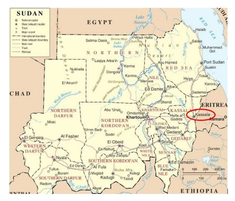
Fig 1. Study location: Kassala state, located in Eastern Sudan, 600 km the capital city, Khartoum. covers an area of 42,282 km<sup>2</sup> and has a population 1.8 million inhabitants. Kassala City is the State capital with a population of ~ 400,000. Kassala Teaching Hospital is the State tertiary hospital and provides service for all patients referred from health centres and rural hospitals.

https://doi.org/10.1371/journal.pntd.0009387.g001