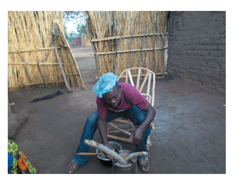
Figure 4. Man wearing wife's hat and pretending to cook.

As demonstrated by the reference to being a 'hero', fast cooking appears to be appreciated by women because it allows them to fulfil their expected role as household providers of cooked food in a timely fashion. However, Photovoice discussions and interviews revealed that economic opportunities for both men and women were limited and that divisions in household roles were reflected in work outside the home. Women's earning potential is also constricted by the