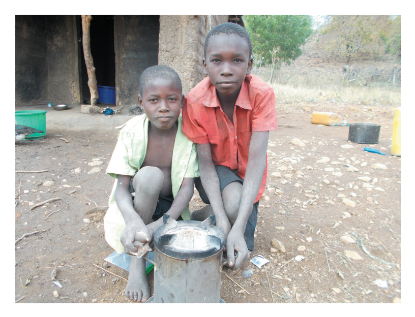
Figure 3. Boys posing with cookstove.

be easily turned up or down (Male CAPS participant Village 1). Some of the ambivalence and possible discomfort with men cooking is shown by a series of images collected by a male CAPS participant, in which he wears his wife's hat and poses with the cookstove (see Figure 4). There appears to be an element of mockery in the image (researcher's interpretation). This implicitly draws attention to gendered household cooking roles and the potential of engagement with new cookstoves to disrupt and shift existing norms.