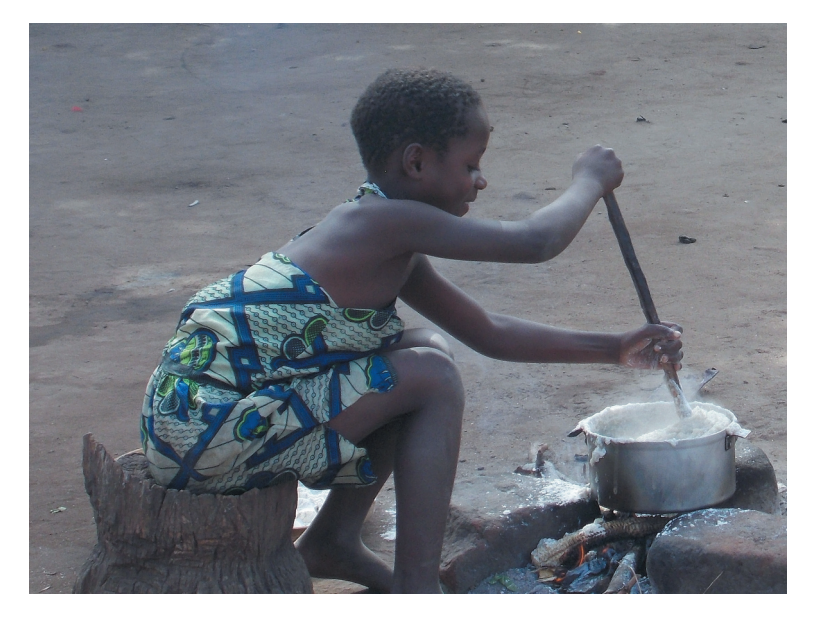
Figure 1. Learning the women's roles.

learning the women's roles although cooking is for everyone, but this one has learnt well so I went closer to take the picture. (Male CAPS participant Village 4)