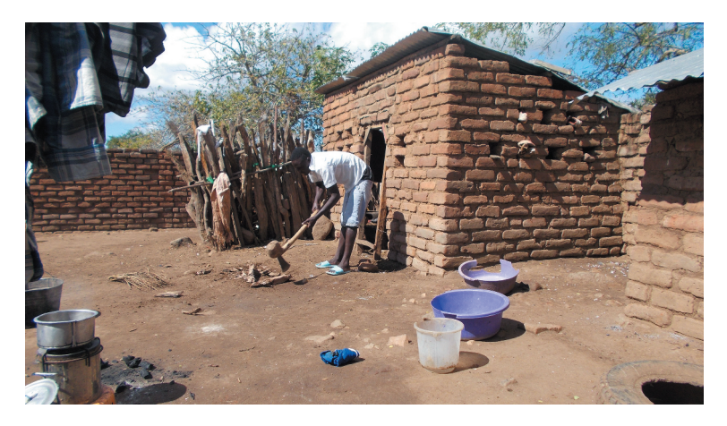
Figure 2. Boy chopping wood for cooking (after persuasion).

but other households try to get the boy to do work which is associated with girls'.