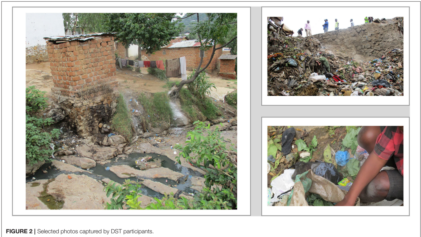
FIGURE 2 | Selected photos captured by DST participants.

Participants focused their digital stories on Water, Sanitation and Hygiene problems rather than other health issues or experiences of community engagement as intended by the researchers. On the other hand, participants raised concerns pertaining to their safety that could impact on processes and outcomes of community-based DST projects.