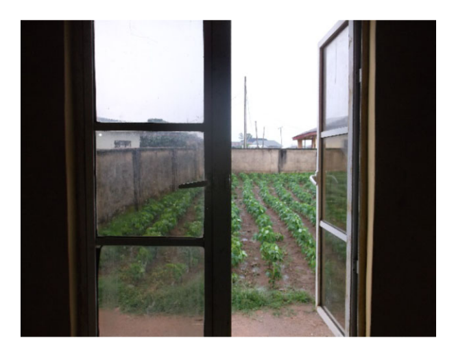
Figure 8. Improved health knowledge and health outcomes by Bashir Ibrahim, male, Group leader from Dan Alhaji community, Kaduna.

The opened window signifies how we are now enlightened through this support group, before it seemed we were in a room with doors and windows closed. This support group has shown us how we can cater and take care of ourselves (Figure 8. Bashir Ibrahim, male, Group leader from Dan Alhaji community, Kaduna).