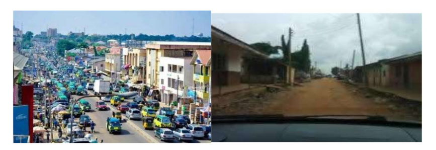
Figure 4. Urban study areas.

people who reside there, what roles they play, different areas or meeting points and important landmarks or physical structures that are regularly used.<sup>32,33</sup> Participants guided the route of the walk based on the initial description of the walk's purpose by the research team, which was to understand the areas where different groups are located and interact and how they are or could be used to deliver health programmes within the community (Figure 5).