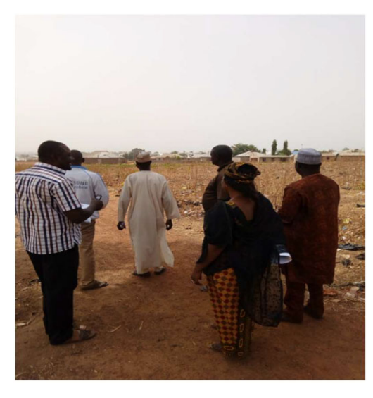
Figure 5. Rural TW (Kaduna) showing researcher and community members.