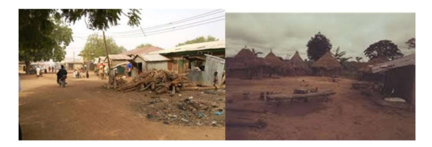
Figure 3. Rural study communities.