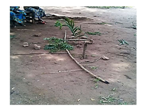
Figure 7. Social map among older women in a rural community (photo: Ogun research team).

and women in the communities who were not involved in the TWs. Participants drew a map of their community, locating existing boundaries, significant structures and areas where different social groups gather. Descriptions of interactions between different community groups and structures at specific times and points during the year were also collected. As participants drew the maps and specified the structures, the research team recorded the sessions and took notes. The SM sessions were initially done with different groups of community members separately (women, men, youth) to gain a greater level of detail from a broad range of perspectives. Specifically, it provided in-depth visual descriptions of how they are currently engaged or could be engaged in the delivery of MAM. Once each of the SM activities was completed with all the groups separately, they were brought together to compare the maps and explore divergent views. The