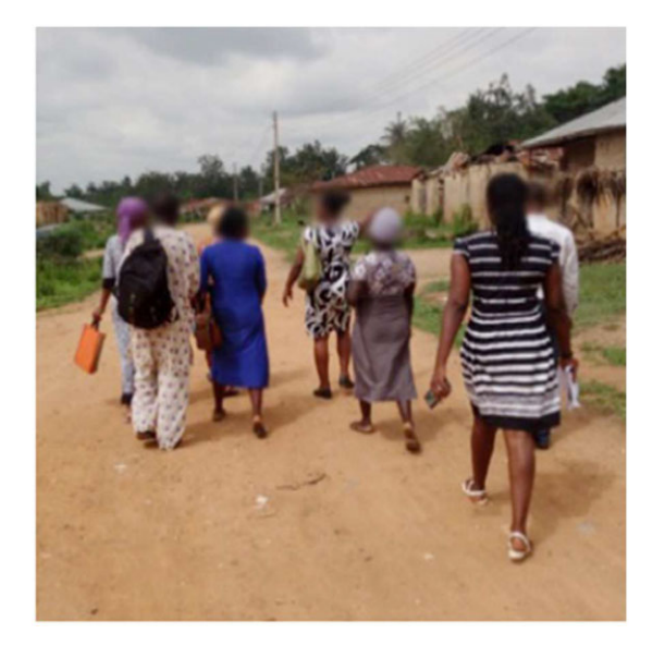
Figure 6. Rural TW (Ogun) showing researchers and community members.

and women in the communities who were not involved in the TWs. Participants drew a map of their community, locating existing boundaries, significant structures and areas where different social groups gather. Descriptions of interactions between different community groups and structures at specific times and points during the year were also collected. As participants drew the maps and specified the structures, the research team recorded the sessions and took notes. The SM sessions were initially done with different groups of community members separately (women, men, youth) to gain a greater level of detail from a broad range of perspectives. Specifically, it provided in-depth visual descriptions of how they are currently engaged or could be engaged in the delivery of MAM. Once each of the SM activities was completed with all the groups separately, they were brought together to compare the maps and explore divergent views. The