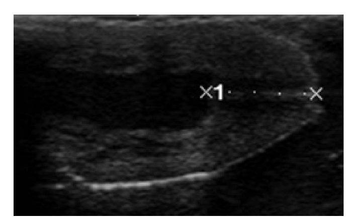
Fig. 1. The lenght of the teat canal.