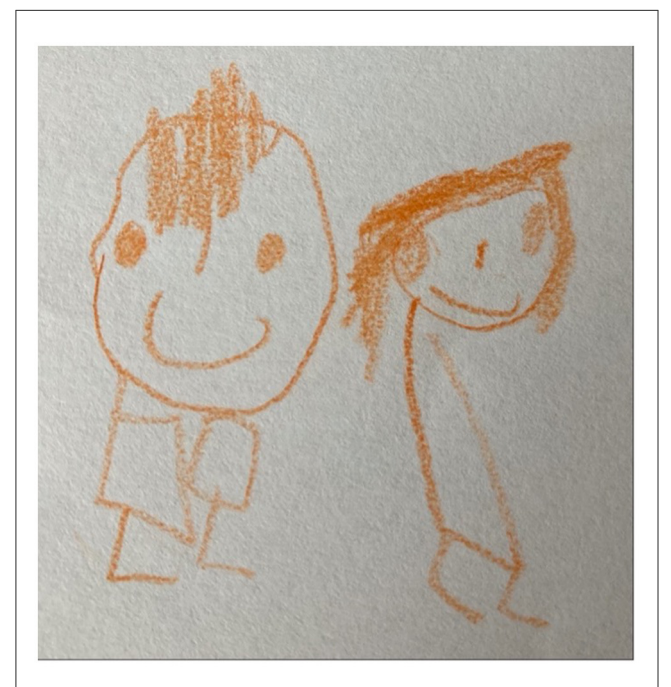
FIGURE 4 Child's drawing

were then visible on-screen and provided as printouts during the remainder of the consultation.