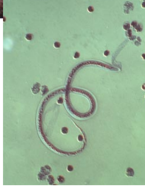
Larval stage of the parasitic worm Wucheria bancrofti

In delivering treatment, high priority is given to achieving full coverage of communities at risk, which may be states, provinces, districts, subdistricts, towns, or villages. Endemic communities are identified using rapid diagnostic tools such as the immunochromagraphic card test.7 Mass drug administration campaigns either deliver drugs to individual homes or dispense them