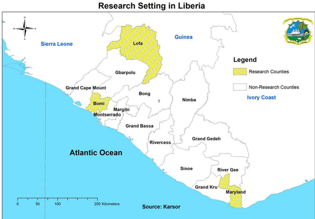
Figure 1. Research setting: Lofa, Maryland and Bomi counties.

partners (3), national health actors (5), county health team members (3) and health facility staff (3). Three focus group discussion (FGD) sessions (24) were held with community health assistants and community health volunteers (CHAs and CHVs) to understand their experience of implementing the NTD integration approach. In-depth interviews were also facilitated with people affected by CM NTDs (6) to understand their health-seeking and treatment experiences. Across all levels of the health system, purposive sampling was used to select respondents based on their expertise or understanding of the issues and to ensure maximum variation in participant views. Key informants were largely selected based on their job role which gave insight into the factors that hinder or facilitate the CM NTD integration process. Focus group participants were selected with CHVs and CHAs because they were familiar with the topic and key issues related to community-based health integration. In-depth interview participants were selected to explore the detailed thoughts of NTD-affected persons regarding disease conditions and treatment experiences.