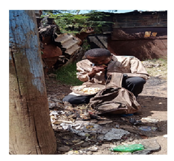
FIGURE 2 Participant with disability resorted to scavenge for food to sustain himself and his family.

and also lack of physical strength to carry water to their households.