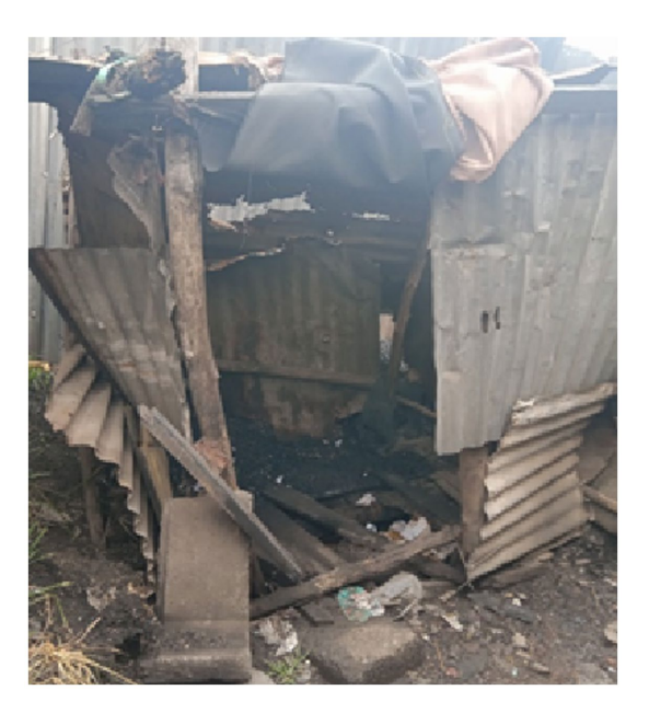
Photo representing marginalization of older adults in access to toilet facilities in informal settlements.

blocks the drain outside my house, I will definitely get sick. ... People do not have toilets here. Very few have toilets... Some people will be merciful and allow you to use their toilets or you pay 10 shillings for use. Or you have to go all the way to the bushes near the river to relieve yourself. What else can one do? There are no toilets" (Older female IDI participant, Korogocho).