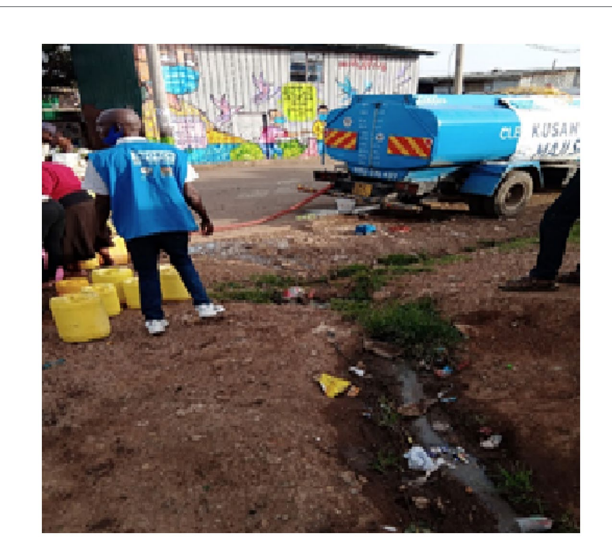
FIGURE 5 Residents jostle for water distributed free of charge

"The smell, then again, you might not have a toilet, you use a bag. In the morning, you throw the bag into the drain. If all this