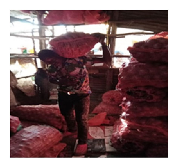
FIGURE 1 Photo depicting exploitation of children heading households by local community members.