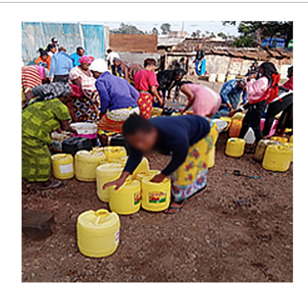
FIGURE 7 Access to water is a challenge for older adults living in informal settlements.

The methodological strength of using CBPR approaches is demonstrated by the contribution in accessing deep and rich data on marginalized and vulnerable sub-populations in neglected and poor urban informal settlements. Our study demonstrates that social mapping, governance diaries and photo voice are valuable and