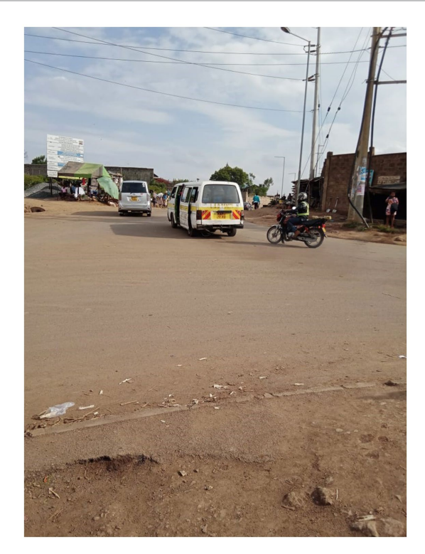
FIGURE 4 Photo of the built environment: roads without signposts, markings, and speed controls as well as and drainages without covers.

"This is a picture of my latrine which I do not use. Many people here do not have toilets. I have no money to build a better one as the current one is a pit latrine which is difficult for me to use and it is in a bad shape-it needs repair. I ask myself of what use it is as I never use it and I always fear for the children who play around could fall into the latrine and that is very dangerous. I plead with the community to build us toilets that can accommodate all of us..." (IDI, Older adult, Korogocho, F).