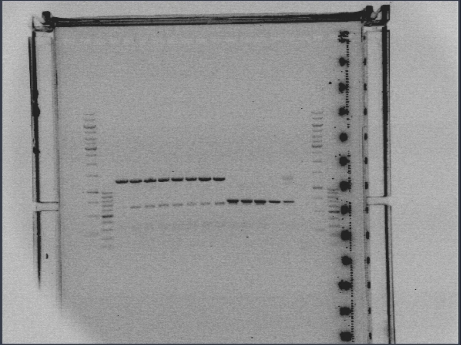
Raw SI Fig. 2