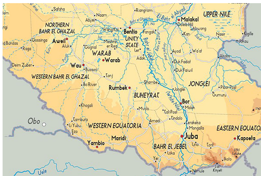
FIGURE 1 Map of South Sudan showing the location of Deim Zubeir.

To prepare the survey, meetings were held with local chiefs, traditional healers, and the local authorities in the four villages, in the presence of the Health Advisor of the Catholic Diocese of Wau, the Public Health Officer, and the parish priest. Epilepsy awareness sessions were organized in public places to sensitize local communities about epilepsy, and to explain the importance to