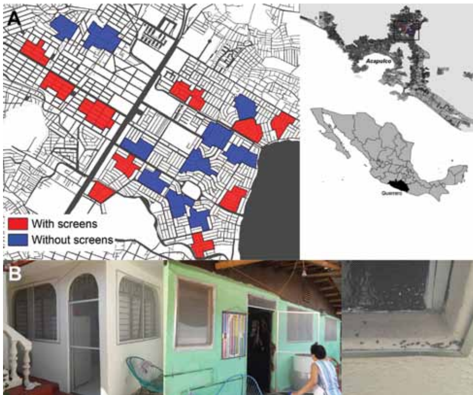
Figure 1. Area of study of long-lasting insecticide-treated screens in Acapulco, Mexico, March 2011–March 2013. A) Locations of clusters in the neighborhoods of Ciudad Renacimiento and Zapata, showing areas with (red) and without (blue) screens. Insets show location of study area (black box) in Acapulco and Guerrero state (black shading) in Mexico. B) Photographs of screens mounted on aluminum frames and fixed to windows and external doors of treated houses in 2012. The insects visible in the right photograph are dead house flies.

were sampled in September 2012 and 311 houses from treated and 320 from control clusters in March 2013.