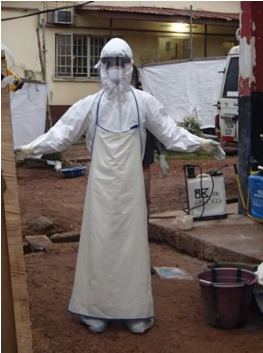
Fig 3 Healthcare worker in personal protective equipment at an Ebola treatment centre in Sierra Leone, 2014