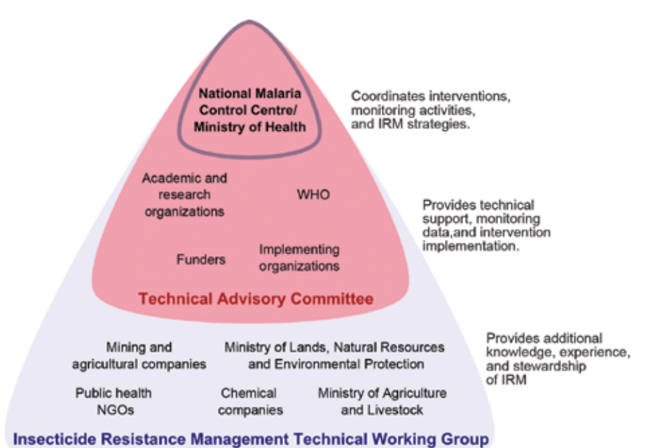
Figure 1. Composition of the Insecticide Resistance Management (IRM) Technical Working Group and the Technical Advisory Committee in Zambia and roles of member organizations. NGOs, nongovernment organizations; WHO, World Health Organization.

Although initial data presented to the incipient IRMTWG were limited, they highlighted insecticide resistance in Zambia, in particular, DDT resistance in areas where this insecticide was used (17). In addition, 2 obstacles became apparent. First, the available data revealed only a small portion of the insecticide resistance in the country, but the data could be expanded through the collaboration of other stakeholders, including research (local and international), private (mining and agricultural), nongovernment