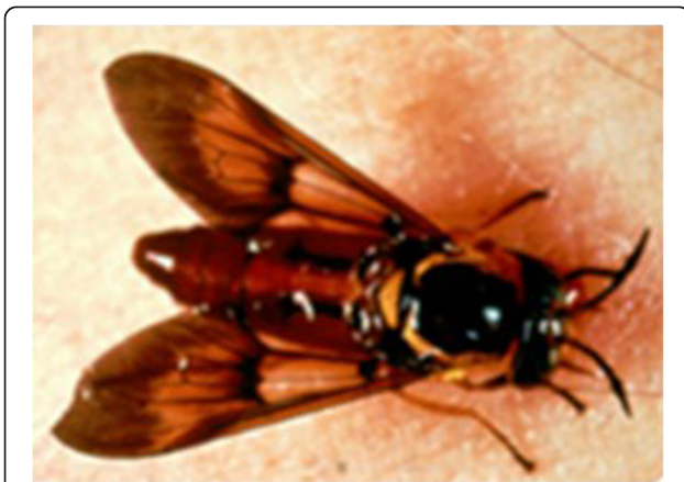
Fig. 2 Picture of Chrysops silacea .

Overall, C. silacea and C. dimidiata were considered to have similar habitats, and in addition to rainforests, have been found in rubber plantations, palm oil groves and fringes of mangrove swamps [32]. Both species frequently occur together; however, in some areas one species was found to dominate the other, and across different ecological settings with C. silacea more likely to adapt to human influenced environments. For example, C. silacea was reported to be more abundant in Kumba, Cameroon (rainforest), Sapele, Nigeria (rubber plantation) and Congo (rainforest) [91]; however, the latter author noted that C. dimidiata was more abundant in the palm groves within the forested study area. Chrysops dimidiata was reported to be more abundant in Benin, Nigeria (palm grove) [30]; Eseka in central Cameroon (rainforest) [61], Bioko island, Equatorial