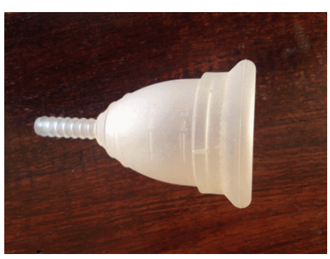
Figure 2 Menstrual cup distributed to girls in cupallocated schools.

The hospitals and health facilities in the study area were provided with leaflets on clinical signs and symptoms of mTSS. Consultant obstetrician and gynaecologists in tertiary care facilities were involved with the study and were prepared to accept any mTSS referral cases during