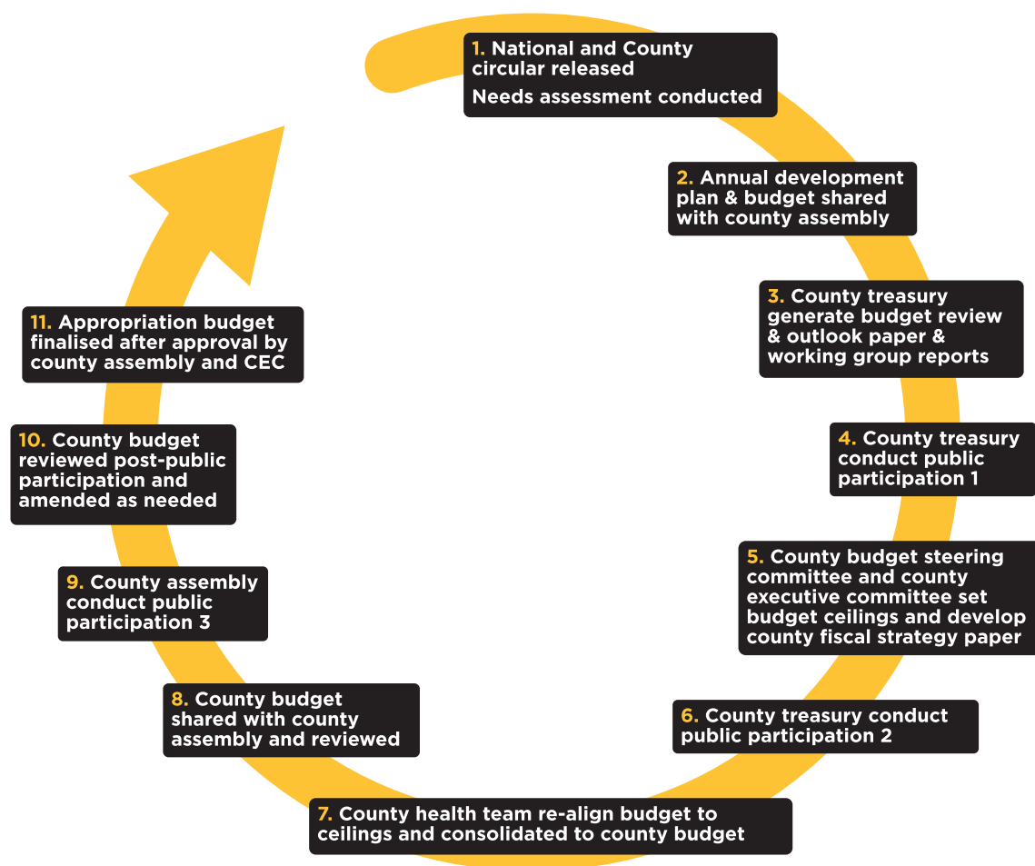
Figure 2. County level annual planning and budgeting cycle

planning as well as developing the 5-year county integrated development plan (CIDP) and the 5-year county strategic plan for health. These plans should align with national health policy and strategic planning documents, including community health strategy guidance (Ministry of Health [Kenya] 2014b). County level also hold responsibility for health service delivery for level one to three services (community, primary and county referral services), recruitment and management of health workers and coordination of partners. Within the county, a number of actors are engaged in the priority-setting process for the annual budget and planning cycle (see Figure 2 ).