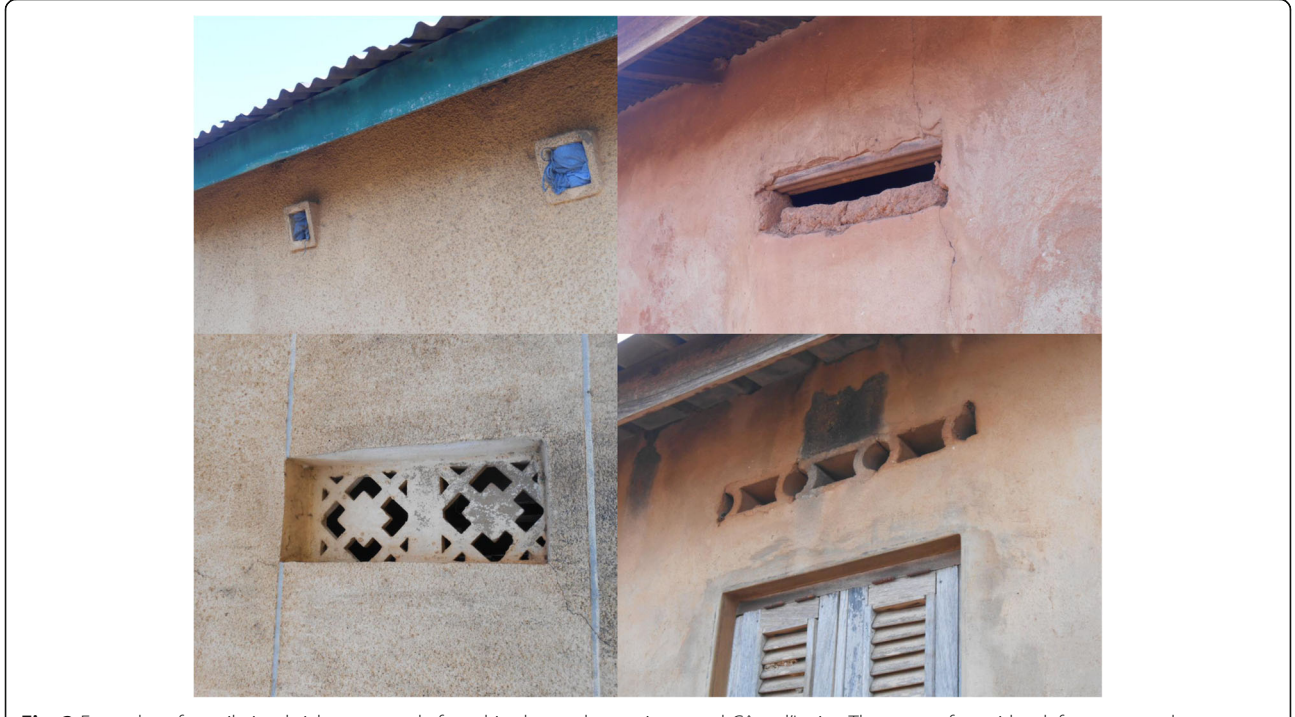
Fig. 3 Examples of ventilation bricks commonly found in the study area in central Côte d'Ivoire. These are often either left unscreened, or blocked (e.g. with LLINs, as shown in the top left image)

The decision was made to use a pyrethroid insecticide for this CRT, despite intense pyrethroid resistance in the study area. The rationale for this decision was two-fold: first, pyrethroids are a relatively safe class of insecticides with low mammalian toxicity and second, of all the candidate actives evaluated in preliminary testing, the beta-cyfluthrin formulation had the highest bioassay mortality for the longest period of time when tested with local, field collected, pyrethroid resistant mosquitoes (Oumbouke, unpublished observations). The efficacy of a pyrethroid against resistant mosquitoes is not surprising, given that the delivery method (i.e. a powder formulation